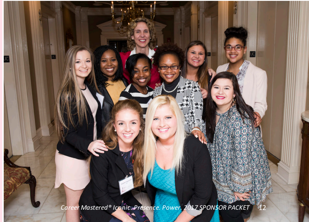
Career Mastered® Iconic. Presence. Power. 2017 SPONSOR PACKET 12