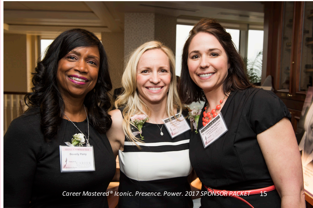
Career Mastered® Iconic. Presence. Power. 2017 SPONSOR PACKET 15